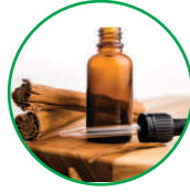
COSMETICS & ESSENTIAL OIL