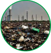
POLLUTION & ENVIRONMENT