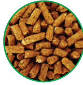
ANIMAL FOOD & FEED