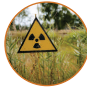
FOOD & AGRICULTURE PRODUCTS (RADIOACTIVE CONTAMINANTS)