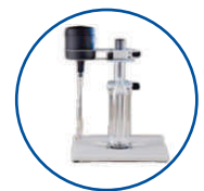
FIXED POINT TEMPERATURE CALIBRATION