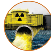
WATER (RADIOACTIVE CONTAMINANTS)