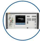
AC MEASUREMENT PRIMARY STANDARDS