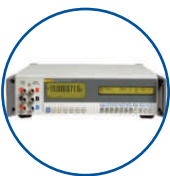
DIGITAL REFERENCE MULTIMETER