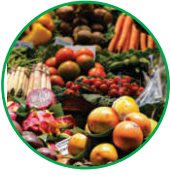
FOOD & AGRICULTURAL PRODUCTS