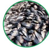
MARINE/AQUA CULTURE FOOD PRODUCTS